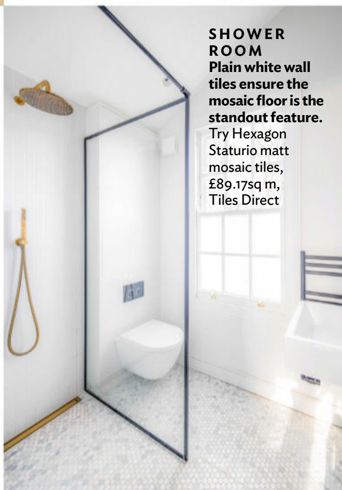
SHOWER ROOM Plain white wall tiles ensure the mosaic floor is the standout feature. Try Hexagon Staturio matt mosaic tiles, £89.17sq m, Tiles Direct